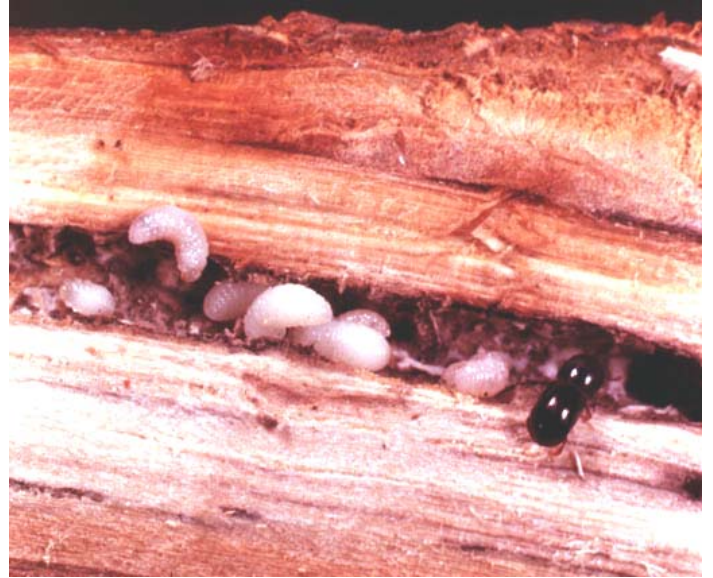
An ambrosia beetle gallery showing the larvae and the mother beetle tending them.

practices to ensure healthy plants will help prevent attack.