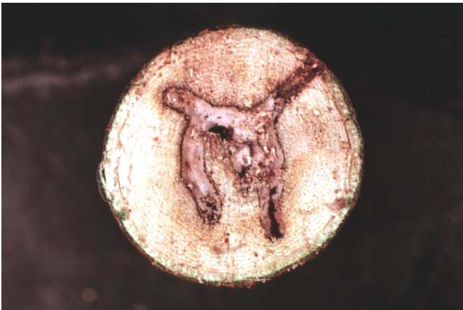
An Asian ambrosia beetle gallery and brood chamber with white ambrosia fungus on the walls.

The initial attack by this beetle occurs in the spring. As the female bores into the wood, a thin, toothpick-like strand of sawdust is pushed from the tunnel. This may extend an inch or more from the surface of the bark. While the females prefer to attack stems under three inches in diameter they will attack stems up to eight inches in diameter. The entry hole is about 2 mm in diameter. The tunnel goes straight into the heartwood and then opens into a cave-like brood gallery with one or two side galleries.