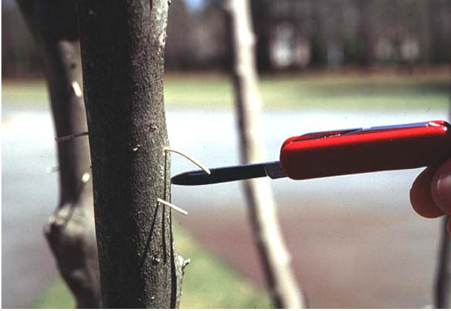
Sawdust plugs pushed from the tunnel of an Asian ambrosia beetle.

in the U.S. in Charleston, SC, in 1974. This beetle attacks over 200 broadleaf trees, shrubs, and vines.