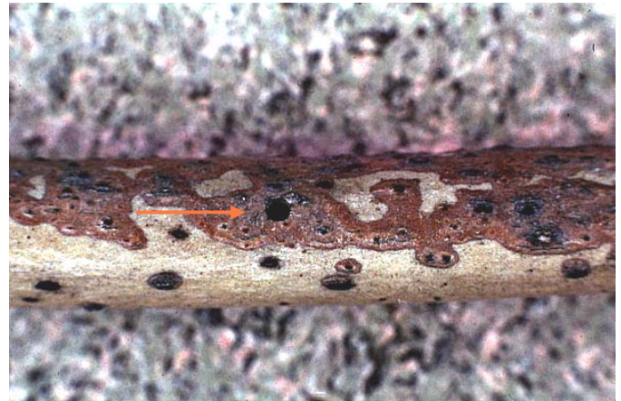
Black Twig Borer entry hole in a magnolia twig.

The first signs of damage by this beetle are fading or wilting of the foliage on the terminals of infested twigs and branches. Close inspection will reveal the presence of a tiny entry hole on the underside of the affected branch.